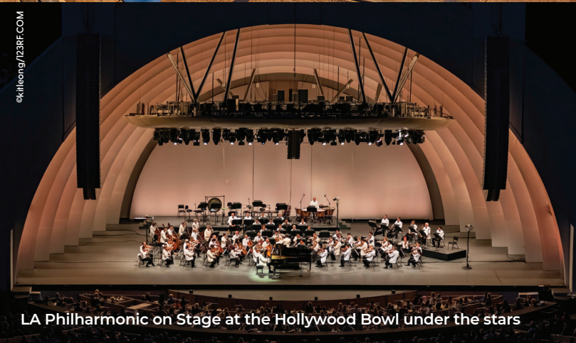
LA Philharmonic on Stage at the Hollywood Bowl under the stars