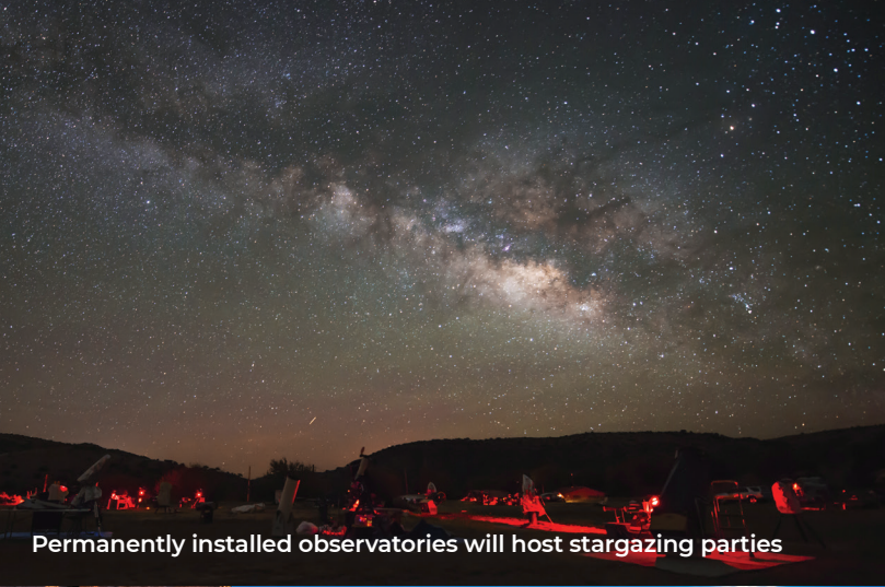
Permanently installed observatories will host stargazing parties

Visit violetcrownaustin.com to hear from experts and learn more about our mission to make a positive impact on the local community, our society, and the natural environment.