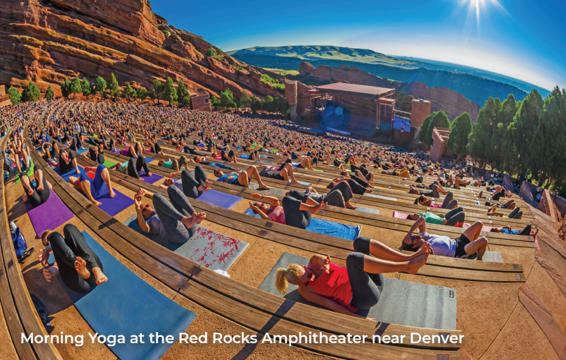
Morning Yoga at the Red Rocks Amphitheater near Denver